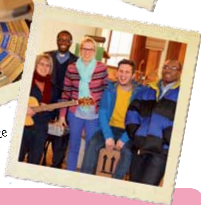
5th April - Worship Service