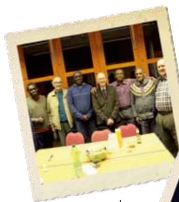
22nd February - Men's Lunch