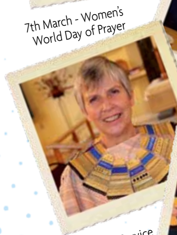
7th March - Women's World Day of Prayer