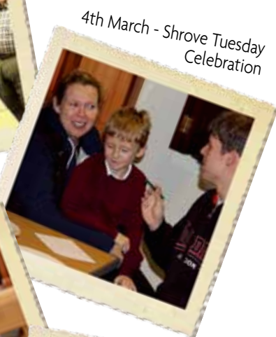
4th March - Shrove Tuesday Celebration