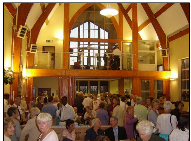
Church interior looking west on the occasion of the dedication of the Powerhouse, 3/9/06