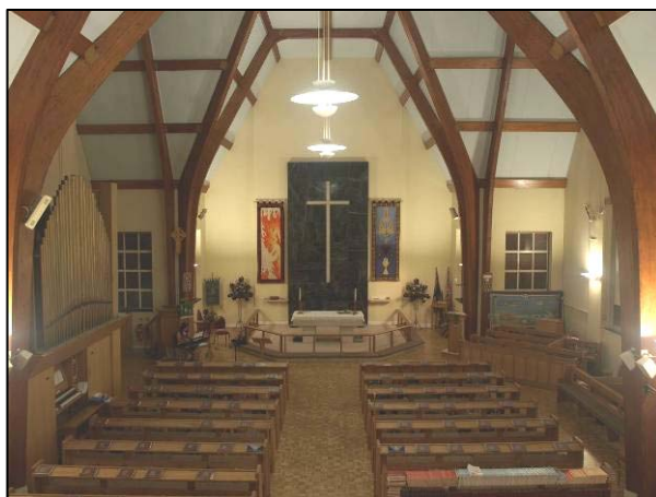
Church interior looking east

7.1 The Church - The Church was consecrated in 1963 and was designed by Northover & Northover. It seats around 120 comfortably (including the choir stalls). The nave and