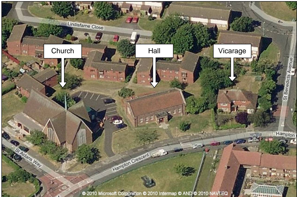
'Birds eye view' of St Aidan's Church, Church Hall and grounds, and Vicarage

7.1 The Church - The Church was consecrated in 1963 and was designed by Northover & Northover. It seats around 120 comfortably (including the choir stalls). The nave and