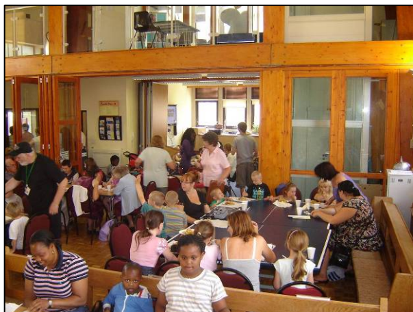
Spilling from the Powerhouse into the church at the 2010 holiday club 'fish & chip' lunch