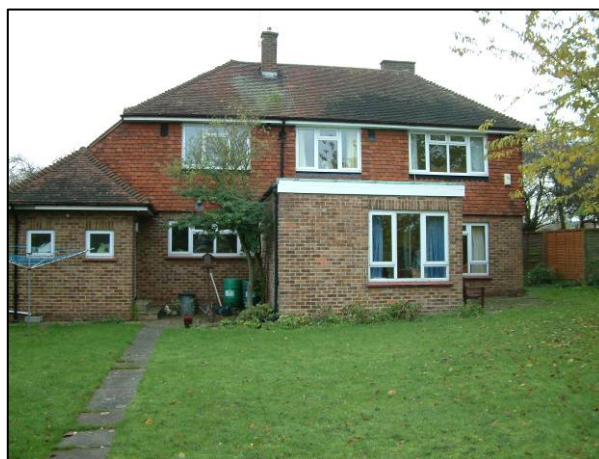
Vicarage, external rear view

(Note: further pictures of the Vicarage, including internal views and views of the garden, are available at www.staidangravesend.co.uk )