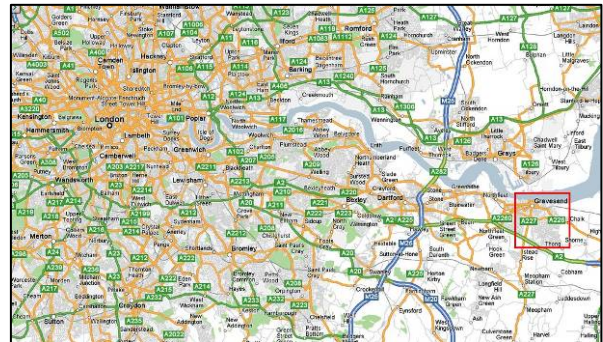
Gravesend in relation to Central London