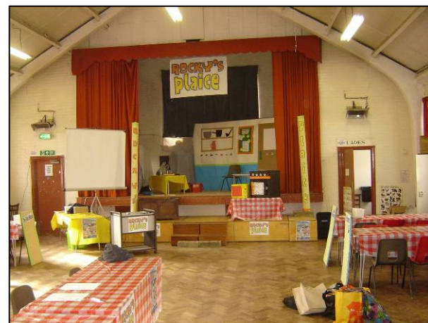
Internal view of the Church Hall looking towards the stage (the Hall prepared for the 2010 summer holiday club)