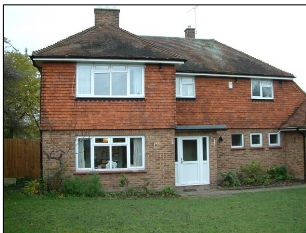
Vicarage, external front view