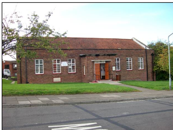
External view of the Church Hall