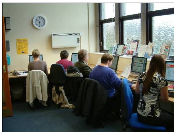
The Powerhouse Computer Centre